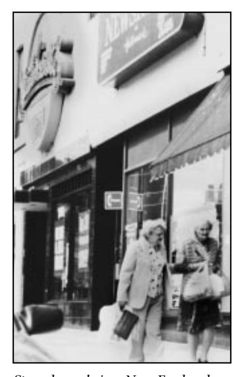
Strawberry's is a New England record chain that offers your favorite mainstream stuff as well as old women at discount prices,

This local flick shop features many favorites and some lesserknown shlock. Starship doesn't feature as many copies of the more main-stream movies, but has a good collection of the almost-B-movies (Planet of the Apes, Jackie Chan, etc.). In addition, the foreign, arthouse, and porn movie sections make this a more interesting place than Blockbuster.