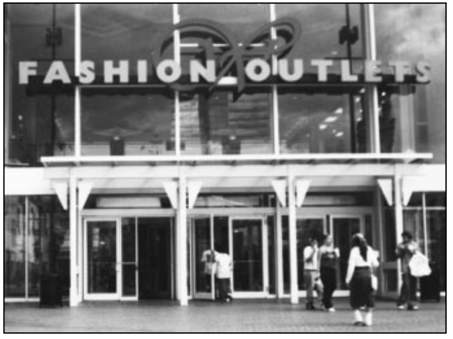
"Like the Balls on a Tall Dog"

Good Indian food at reasonable prices. Don't let the claustrophobic dining room turn you away.