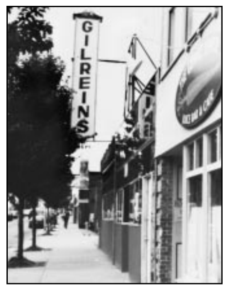
Gilreins and Gentle Lentil on Main Street.

The food's pretty good and, if you ask, they'll tell you anything you'd ever want to know about Worcester.