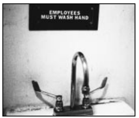
The restroom at Da Lat: W arcester is full of interesting attractions.