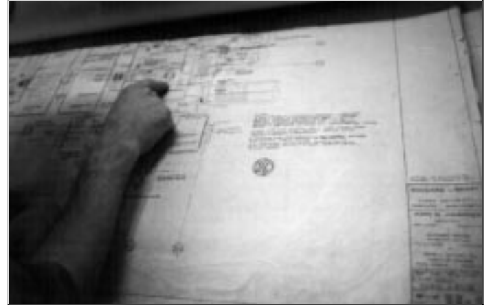
Library floor plans indicate a structure clearly not intended for human activity. It took fifteen years of construction to ready the library for human use.