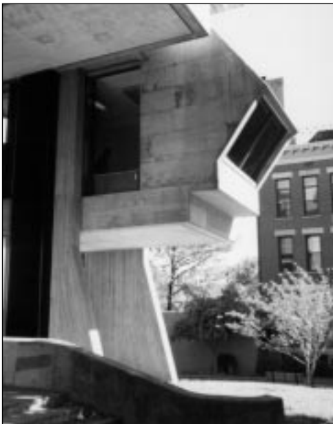
An alien spacecraft shuttle pod locked and docked in its bay on the spaceship