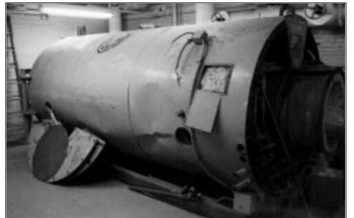
An engine damaged in the initial landing currently resides behind closed doors in the basement of Jonas Clark Hall.