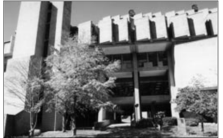
The tall structure at left is a landing leg; two retro-reflectors are visible on the roof; note angled re-entry heat shields. The trees, of course, are fake.